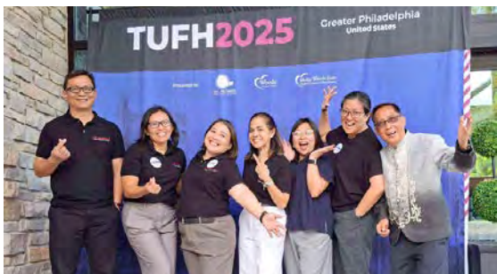
SIHI Philippines at TUFH 2025 in Philadelphia, USA .