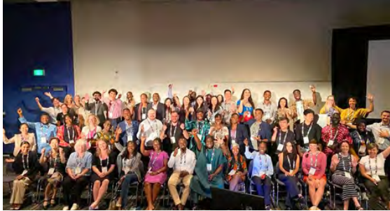
SIHI China youth co-creation participatory workshop in Montreal, Canada .

Through these platforms, SIHI actively bridges local action with global dialogue, thus creating synergy across partners.