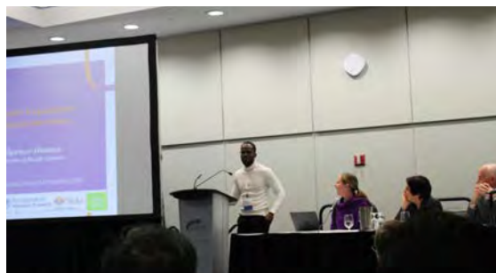
SIHI Malawi at the 74th ASTMH Annual Meeting in Canada .