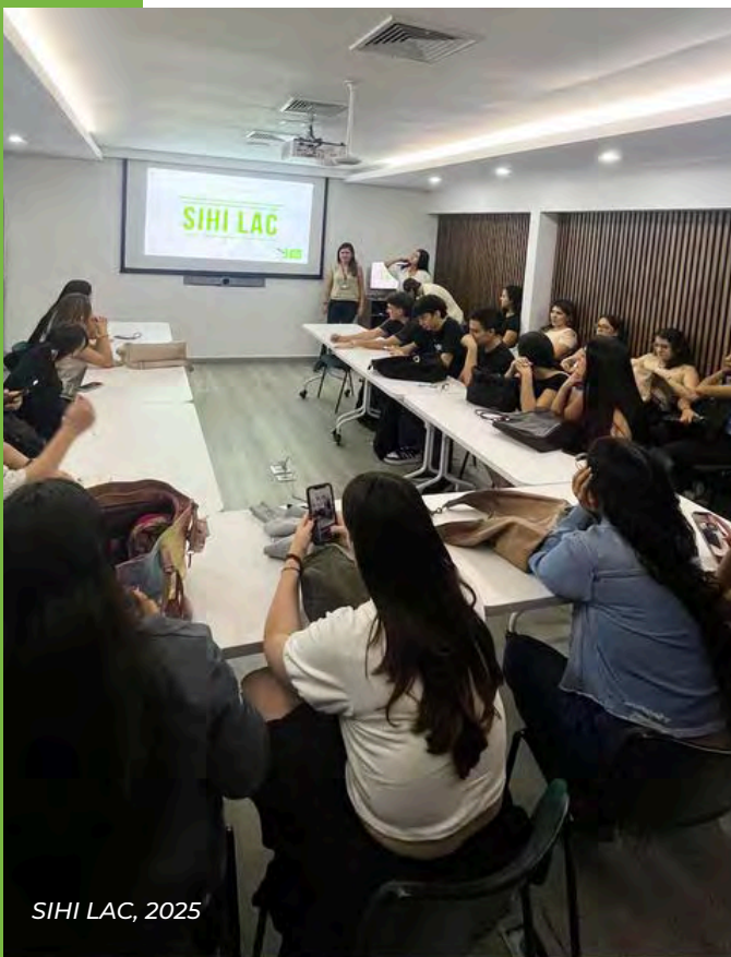
SIHI LAC, 2025