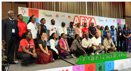
SIHI South Africa at the Afyafest Nairobi Health Ventures Hackathon in Nairobi, Kenya .