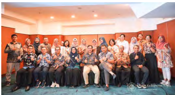
SIHI Indonesia at the STRIPE Sustainability Workshop in Jakarta, Indonesia .