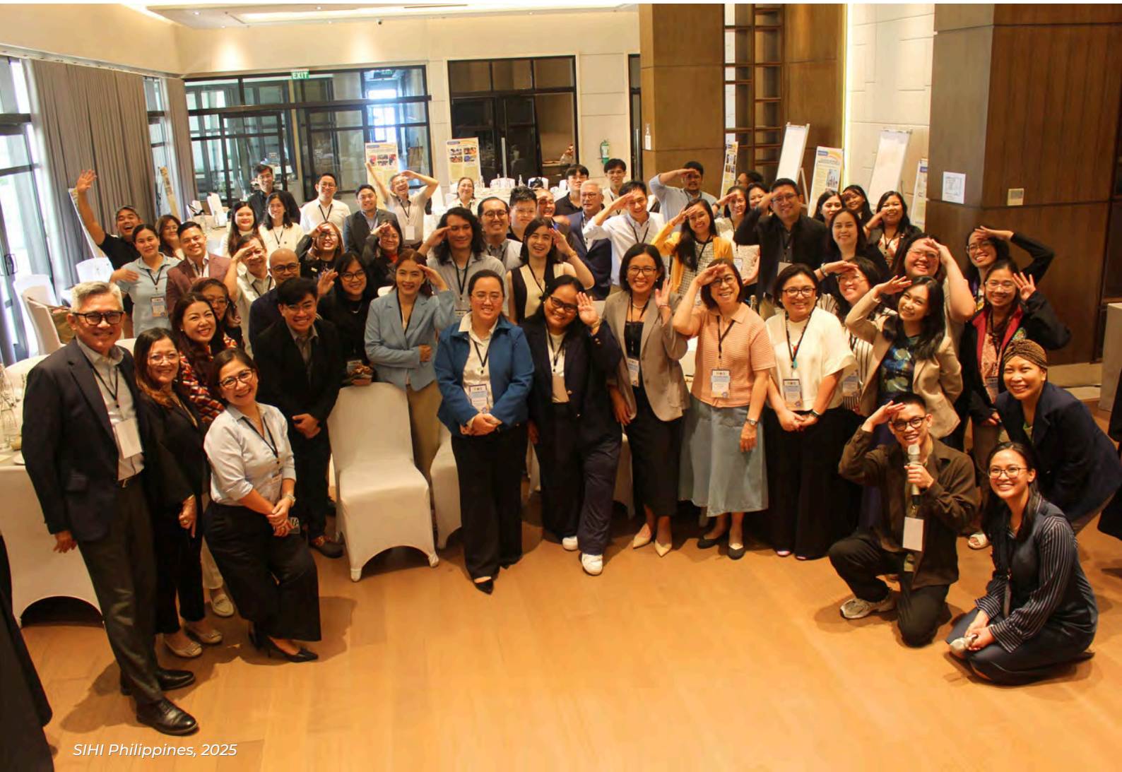
SIHI Philippines, 2025

Together, these advocacy and convening efforts strengthened cross-sector and cross-regional partnerships , deepened knowledge exchange, and elevated locally driven innovations within both policy and global dialogues.