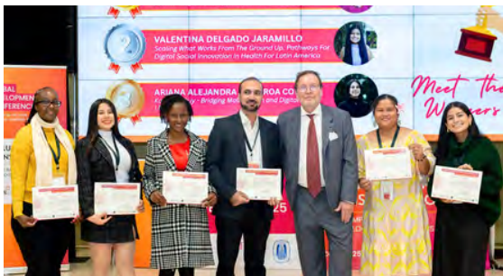
SIHI LAC at the Global Development Conference 2025 in France .