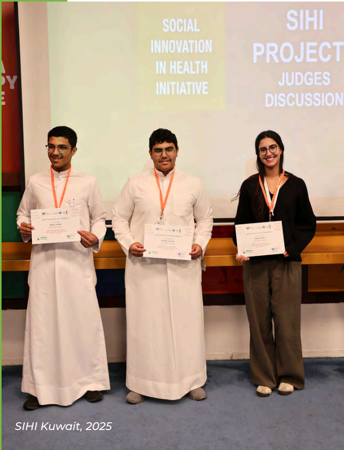
SIHI Kuwait, 2025

Beyond formal courses, hubs equipped innovators with practical skills in implementation, research, and scaling solutions.