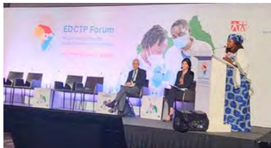
SIHI Nigeria at the EDCTP Forum in Kigali, Rwanda .