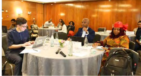
SIHI Nigeria at the WHO TDR Participatory Designation in Addis Ababa, Ethiopia .