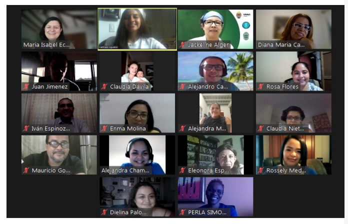
SIHI Honduras and SIHI LAC Hubs hold community-based methodology workshop.

n the third quarter of 2021, SIHI Honduras supported the coordination and dissemination of several activities led by SIHI LAC and PAHO, contributing to the outreach and promotion of social innovation in health in other Central American and Caribbean countries. This is reflected in the increased participation of people from the region in the bimonthly webinar Café Virtual, as well as the inclusion of the conference event, Community-based Participatory Research and its Contributions to Social Innovation in Health, presented at UNAH annual scientific event Jornada Científica in July 2021.