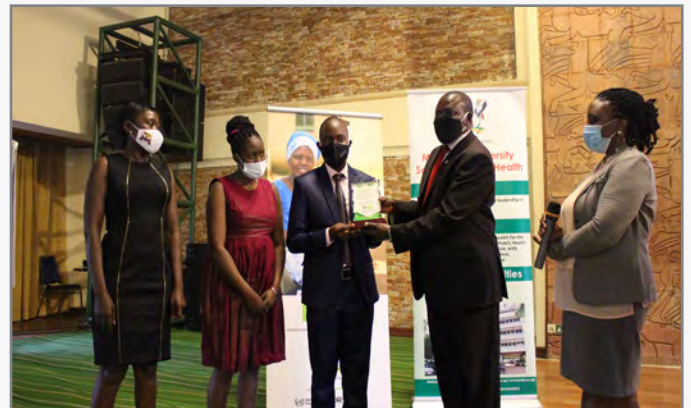
Above: Top social innovations in health in 2020 were awarded in SIHI Uganda's 3rd national stakeholders' workshop.

Below, left: The SIHI Uganda team made a site visit to the SEEK-GSP project in Northern Uganda. SEEK-GSP provides support to people living with HIV.