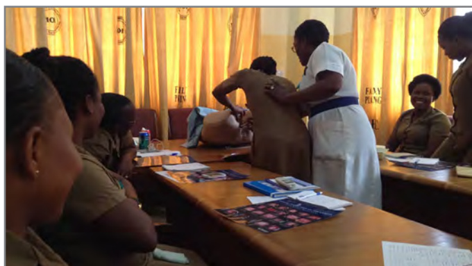
One of SIHI Ghana's identified social innovations trains community nurses in conducting visual inspection of the cervix with acetic acid and cervicography to increase access to cervical cancer screening.

The SIHI Ghana team conducted in-depth interviews with the implementing research teams and beneficiaries of both innovations. The team also produced short videos explaining the two projects. These allowed the team to gain more insights on the impact of these interventions, explore collaborations with other researchers in Ghana, and share local innovations with the global community.