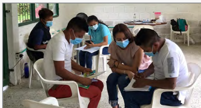
SIHI LAC held a workshop in March 2021 for the co-creation of pedagogical material with rural communities, as part of a participatory research project to develop a community surveillance system for cutaneous leishmaniasis in endemic areas.

To work towards financial sustainability, SIHI LAC created a sustainability model with Rebecca Thomas, a consultant in global health business strategy. Potential funding sources were identified, and marketing materials were created to best position the hub. The team is set to implement the sustainability model in 2021.