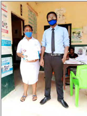
As part of its case research writing, the SIHI Nigeria team conducted site visits to the shortlisted social innovations in health.

Earlier, in October, the SIHI Nigeria team made verification calls and visited four shortlisted innovations to personally conduct interviews among innovators, implementers, and beneficiaries. The team found these social innovations insightful, revealing, and engaging.